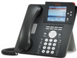
9650C IP Telephone