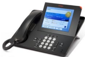
9670G IP Telephone