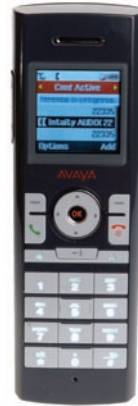
3631 Wireless IP Telephone

range of features and functions; it comes with an integrated button expansion module for quick access to features and people and super efficiency.