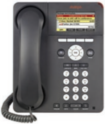
9620C IP Telephone