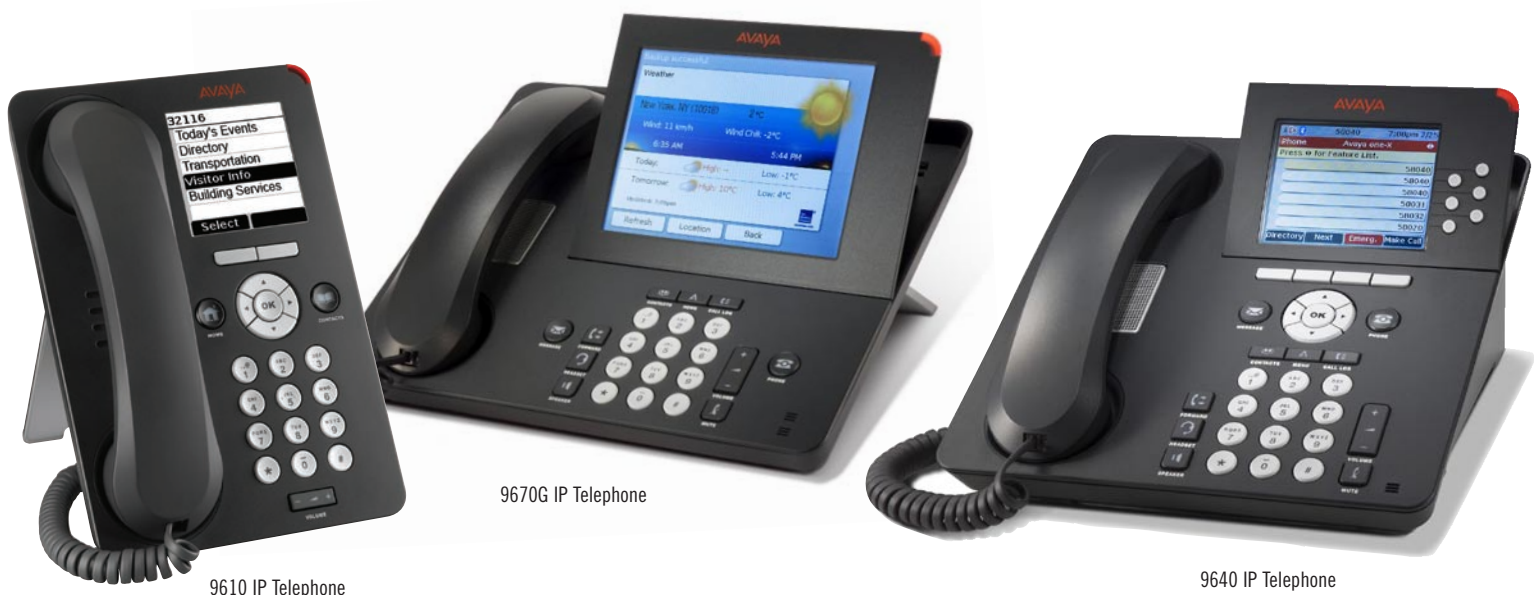
9610 IP Telephone

For the Navigator: the 9650 and Button Module. The Navigator also spends a great deal of time on the phone, largely handling calls for others. Receptionists and executive assistants are examples of Navigators. The 9650 provides one touch access to a great