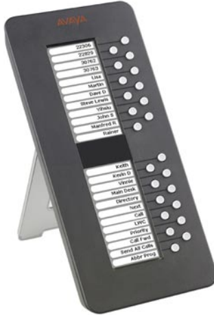
24 Button Expansion Module