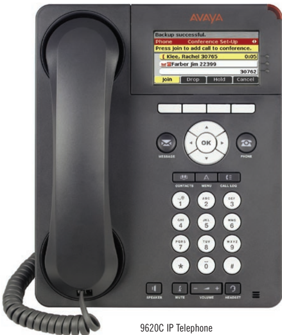
9620C IP Telephone

With the evolution of today's smart phones, PDAs, user interface design has made great leaps forward. Avaya's 9600 Series of IP Telephones have a clear and elegant interface. High resolution graphical displays make it easier to read contextual menus, prompts and instructions – anticipating your intentions and needs. Critical functions like call transfer, conferencing and forwarding are easy for beginner or veteran alike. Softkeys right on the display itself, along with scrolling menus, guide you through every process. Even third-party applications such as company-wide corporate directories can be invoked and used easily. The user interface is consistent across the entire