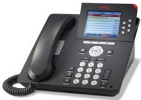
9640 IP Telephone