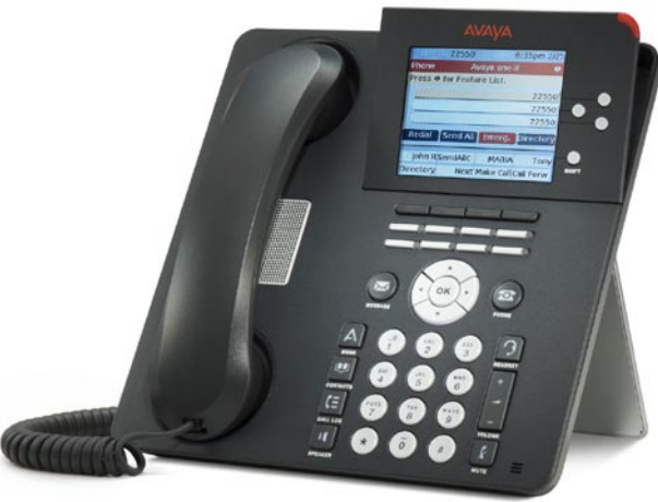
9650 IP Telephone